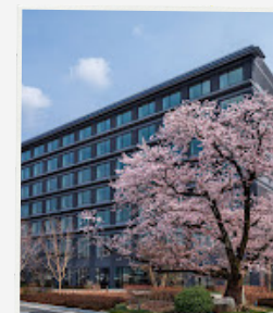
Takayama Green Hotel or similar subject to availability