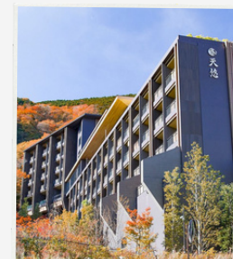
Hakone Kowakien Tien-Yu or similar subject to availability