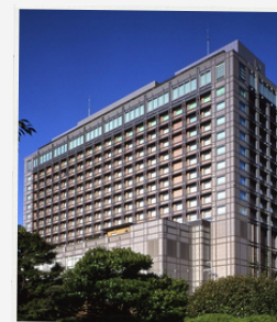
Hotel Okura Kyoto or similar subject to availability