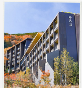
Hakone Kowakien Tien-Yu or similar subject to availability