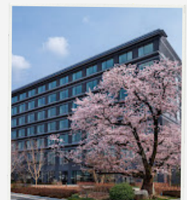
Takayama Green Hotel or similar subject to availability