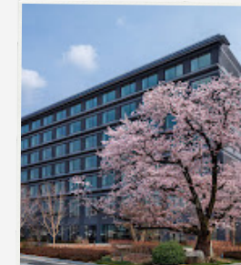
Takayama Green Hotel