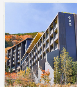
Hakone Kowakien Tien-Yu