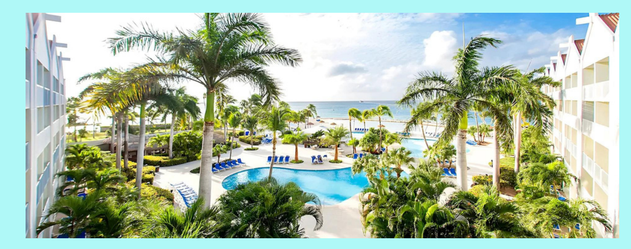
Our Exclusive All-Inclusive Package Tailor Made for Dentist Group